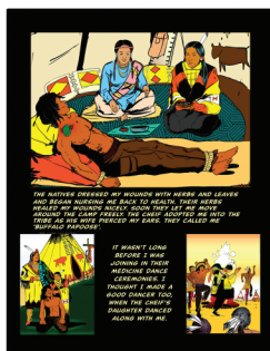
FULL COLOR COMIC PAGE