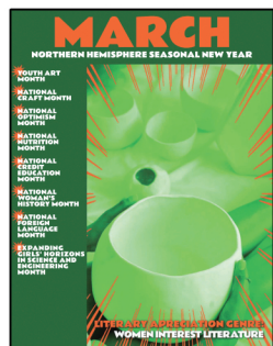
CHAPTER COVER PAGE